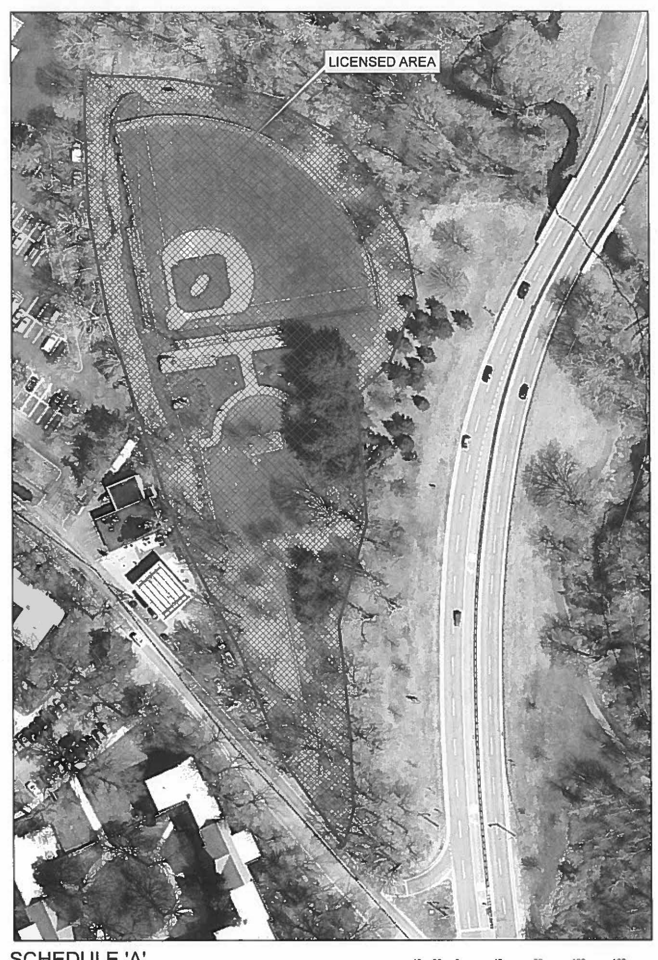
SCHEDULE 'A' VIRGINIA ROAD BALLFIELD WESTCHESTER COUNTY DEPARTMENT OF PARKS, RECREATION AND CONSERVATION